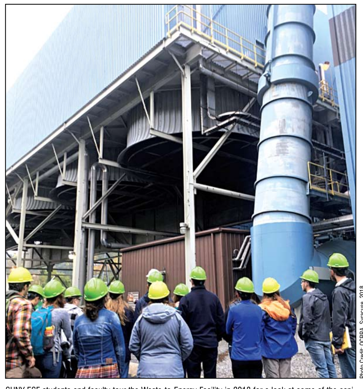
SUNY-ESF students and faculty tour the Waste-to-Energy Facility in 2018 for a look at some of the capital improvements that were recently completed. In 2015, Covanta and OCRRA agreed to invest more than $15 million in site upgrades that would prolong the life of and improve the efficiency of the Facility.

tal improvement projects is just one way that OCRRA is reinvesting in our mission to sustain a world-class waste management system that benefits our community and environment.