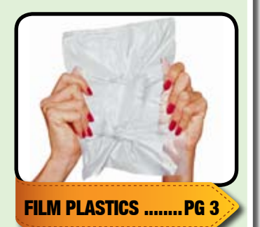
Plastic bags and wraps don't belong in the blue bin, but you can recycle them elsewhere.

Customers invited to use Ley Creek Transfer Station until further notice.