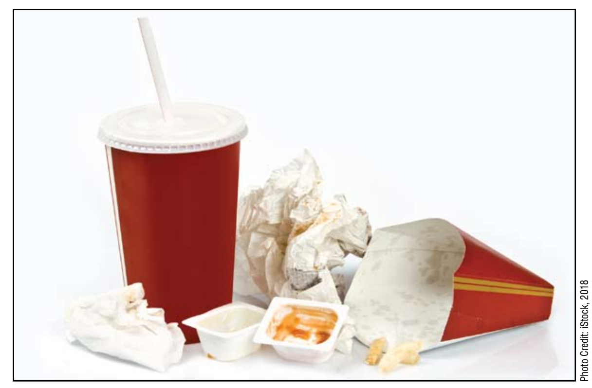
Most fast food packaging such as wrappers, straws, cups, plastic or Styrofoam food containers, receipts and the like are not recyclable. They should go in the trash.

Cups & Cup Holders: No plastic or paper cups should ever go in the recycling bin. These materials will not be recycled, but rather cause contamination in the paper and cardboard recycling, which devalues it. Bring a reusable cup or travel mug with you. They keep your drink at a better temperawrapped in recyclable ture, and already easily fit