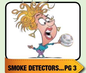
Rhoda sounds the alarm on proper disposal.