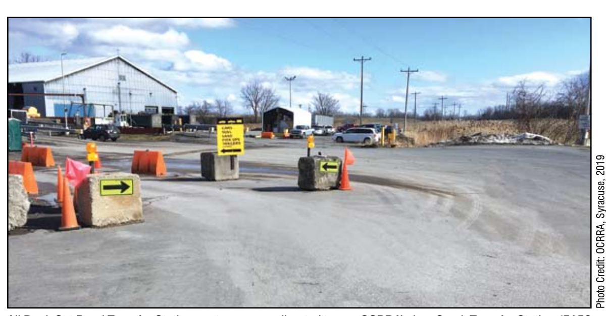
All Rock Cut Road Transfer Station customers are directed to use OCRRA's Ley Creek Transfer Station (5158 Ley Creek Drive in Liverpool, just off the 7th North Street exit of Route 81) until further notice. When entering Ley Creek, follow signs for residential traffic; as the roadway opens up, turn left into the lane formed by orange barriers; stop at attendant shack for further direction.

The Ley Creek Transfer Station is open to resi-Creek Dr., opposite the dents Monday-Friday from