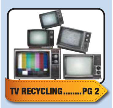
Find out where you can recycle your old TVs and other electronic waste.