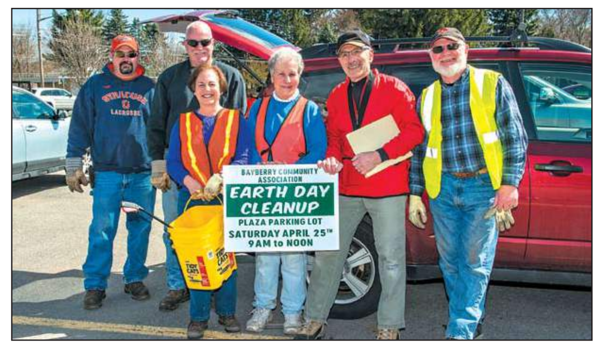
Members of the Bayberry Community Association pause during their 2015 cleanup for a group photo. Join groups like this for the 2016 Earth Day Litter Cleanup happening April 22 and 23. Help beautify Onondaga County! The registration deadline is April 15. Register online or by filling out the form below.

OCRRA's 2015 Earth Day Litter Cleanup saw more than 7,000 residents scouring the roadsides, streets, parks and ditches to collect over 101,000 pounds of ick (that's more than the weight of 34 Prius cars). More than 2,262,800