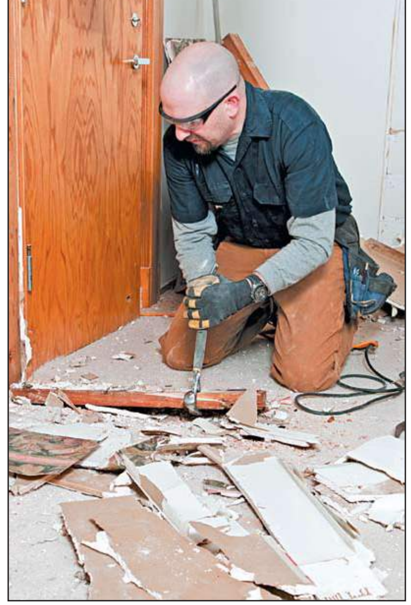
Whether you are a do-it-yourselfer with a few household projects to complete or a contractor with lots of jobs, OCRRA can help you manage your waste and construction debris! OCRRA's Drop-Off Sites make it easy and convenient to get rid of sheetrock, floor boards, paneling, windows, fixtures, roofing, concrete blocks and more.

Mark Donnelly can be reached at mdonnelly@ocrra.org.