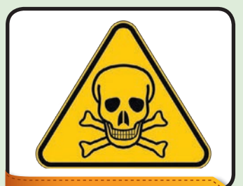
HOUSEHOLD TOXICS... PG 2

What household toxics are accepted at OCRRA's drop-off program?