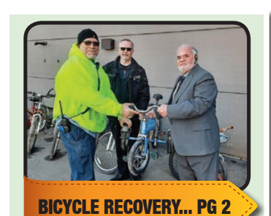
OCRRA is working with CNY Family Bike to help those in need.

Spring 2022 Newsletter | Volume 31 | No.1 | 100 Elwood Davis Road, North Syracuse, NY 13212-4312 | 315-453-2866 | OCRRA.org