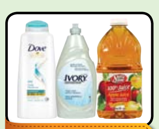
PLASTICS RECYCLING.....PG 6

Not all plastics go in the blue bin. Learn which ones do and don't!