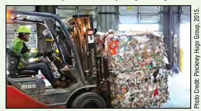
Get details on what should and should NOT go in your blue bin: www.tinyurl.com/RecycleRight2019

See how the recycling sorting process works: www.tinyurl.com/RecyclingSorting