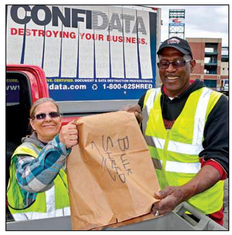
Event staff empty confidential documents into Toters before shredding them at OCRRA's May 2016 Shred-o-Rama event. On Saturday, May 6, OCRRA again partners with Confidata and Shred Solvers for the spring event, which takes place at NBT Bank Stadium. The event is open to households only; reservations are NOT needed and the event is free.

Interested in reducing the amount of confidential documents you amass in the first place? Consider