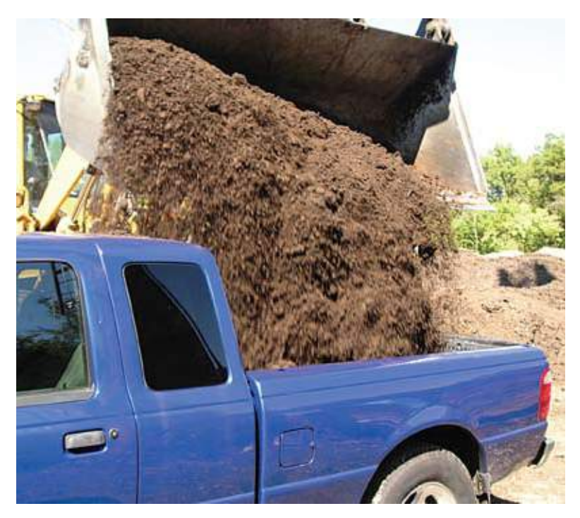
With OCRRA's new compost and mulch loading service you can readily get large volumes of material for a great price, but what if you don't have a truck or trailer to haul it? Rent or use the internet (www.Truxxit.com) to get a truck or hire a local landscape and trucking company to transport your compost or mulch for you.

And, if having a pile of compost or mulch sitting in your driveway for a week or two while you gradually spread it throughout your landscape and garden isn't an option, Schanbacher says his company can deliver OCRRA compost or mulch in one and one-half cubic yard, reinforced nylon "bulk bags." from blowing around and when it's empty they'll pick