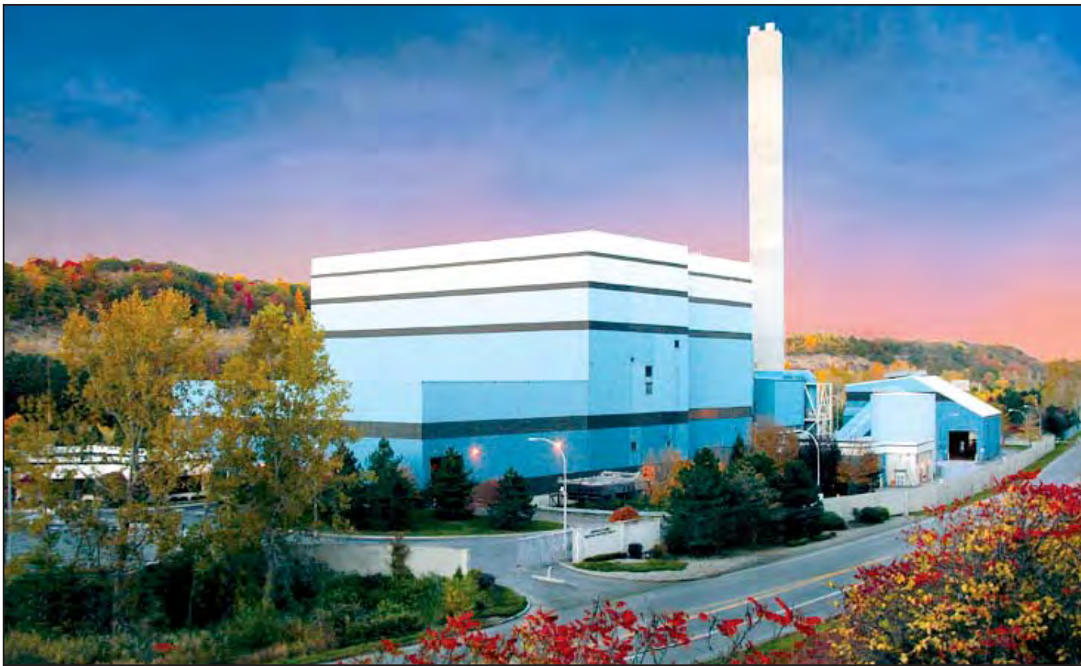
Onondaga County trash is sent to the local Waste-to-Energy Facility where it is burned at high temperatures and converted into electricity (enough to power 15% of households in our County). Around 9,000 tons of metal is also pulled out of the trash and recycled each year at the Facility.

A: The results from the 2015 stack testing indicate that the Facility is operating acceptably and that the air pollution control devices are functioning properly. As shown by the graph on the next page, many of the tested constituents were considerably below the permit limit.