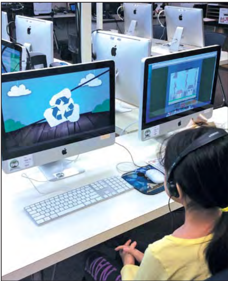
Students at Nate Perry Elementary school engage with OCRRA's new environmental education video series in their computer lab. The short videos, interactive games and curriculum-aligned lessons make classroom integration a snap. Download the free program the teaches kids how to be responsible for their waste at www.OCRRA.org/educational_resources .

"Our 6th graders were amazed by the recycling video showing how OCRRA