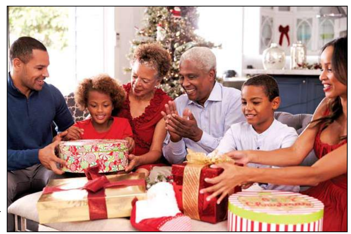
When it comes time to open presents this holiday, make sure your guests know what is recyclable and where to put recyclables to ensure your blue bin is well used this season. For details on what is recyclable in Onondaga County, visit OCRRA.org.

"Out with the old" does not have to mean "out to the curb." Most things that are upgraded can be reused by someone else; this is especially true for textiles. Consider a post-holiday clothing swap among friends and family, and/or donating to your preferred charity. Visit www.tinyurl. com/cny-textiles for a list Pair your trash cans with of donation spots. For other items you have replaced, consider posting on craigs