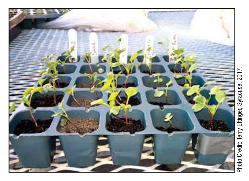
SUNY ESF students grew seedlings in various mediums, including OCRRA Compost, this past fall. Pictured here is phase one of an experiment looking to find the best growing medium for 11 different vegetables and herbs. Check back next spring for the final results!

mix different ratios of compost with the other media to see if the combinations result in more vigorous transplants than the various media alone.