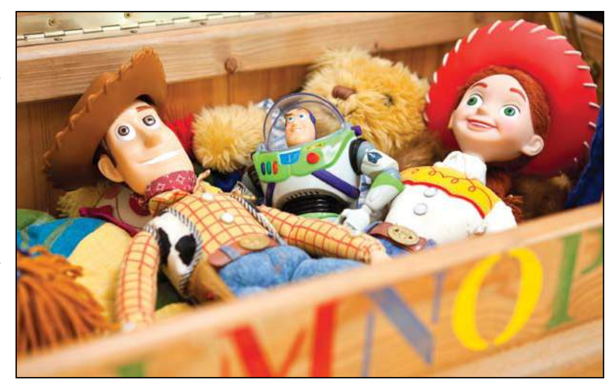
Holiday gifts often replace old items, but who is responsible for disposing of the old items? Extended Producer Responsibility legislation requires manufacturers to be responsible for the end-of-life management of their products. Let your legislators know you support this effort by contacting them today, the environment will thank you. Visit www.usa.gov/elected-officials for contact details.

How do manufactur-Who is responsible for ers become responsible for their items? It must be mandated to ensure an even playing field for the manufacturers. Voluntary programs are nice, but don't necessarily get the job done. A voluntary EPR program for alkaline batteries was piloted recently. Onondaga County collected the most batteries of all program participants; but success resulted in the industry disbanding this voluntary effort after five years, due to cost constraints.